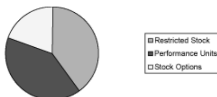
Combination of Long-term Incentive Vehicles